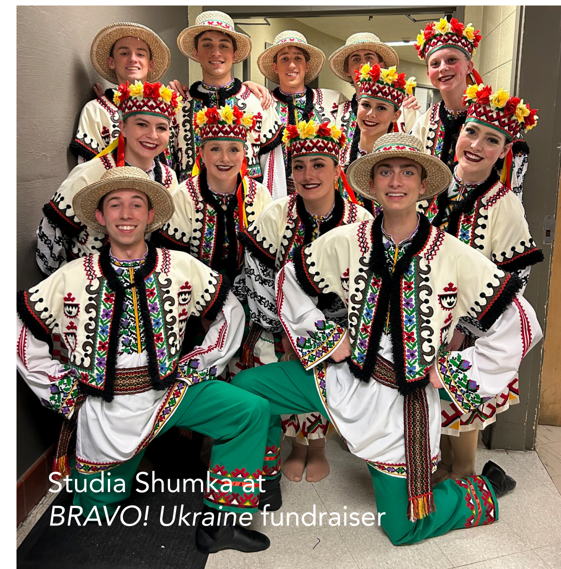
Studia Shumka at BRAVO! Ukraine fundraiser