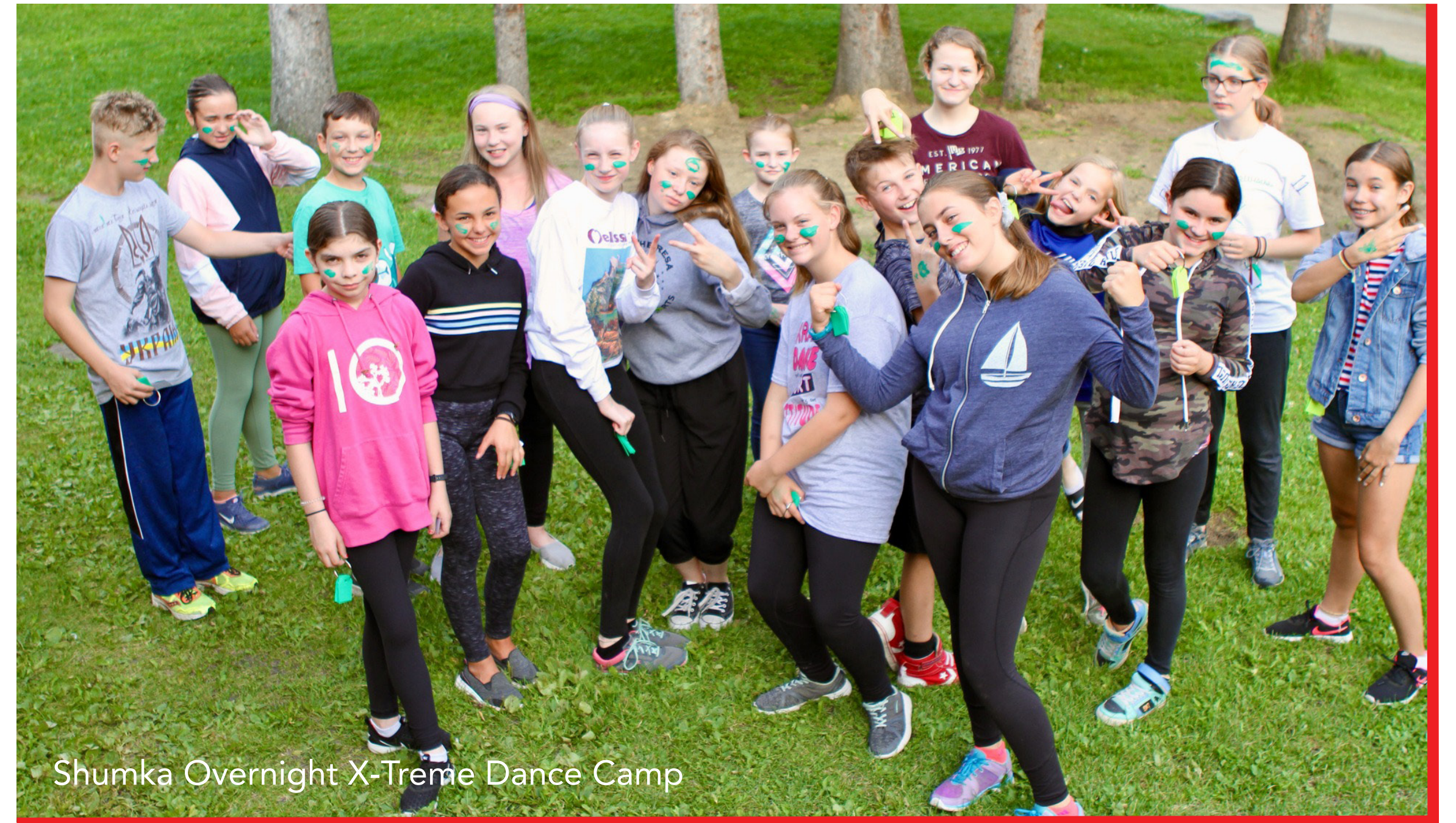
Shumka Overnight X-Treme Dance Camp

previous season. Dancers in Shumka's Seniors and Swans programs have quickly formed one of the most passionate, proud, and welcoming communities of dance-enthusiasts under the Shumka umbrella.