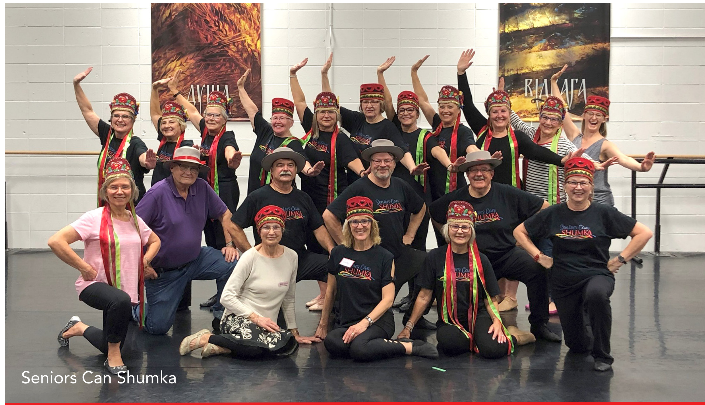
Seniors Can Shumka