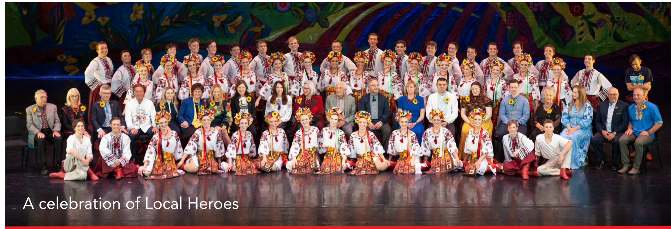
A celebration of Local Heroes

In fall of 2022, Shumka decided to begin a campaign to celebrate Local Heroes in the diaspora whose efforts have provided humanitarian aid, military support and immigration assistance to Ukrainian families, friends, and fellow keepers of the culture. Shumka dedicated their fall performance of Shumka on Tour in Edmonton to these Local Heroes, which included a pre-show reception, an on-stage thank-you, and a photo with the cast.