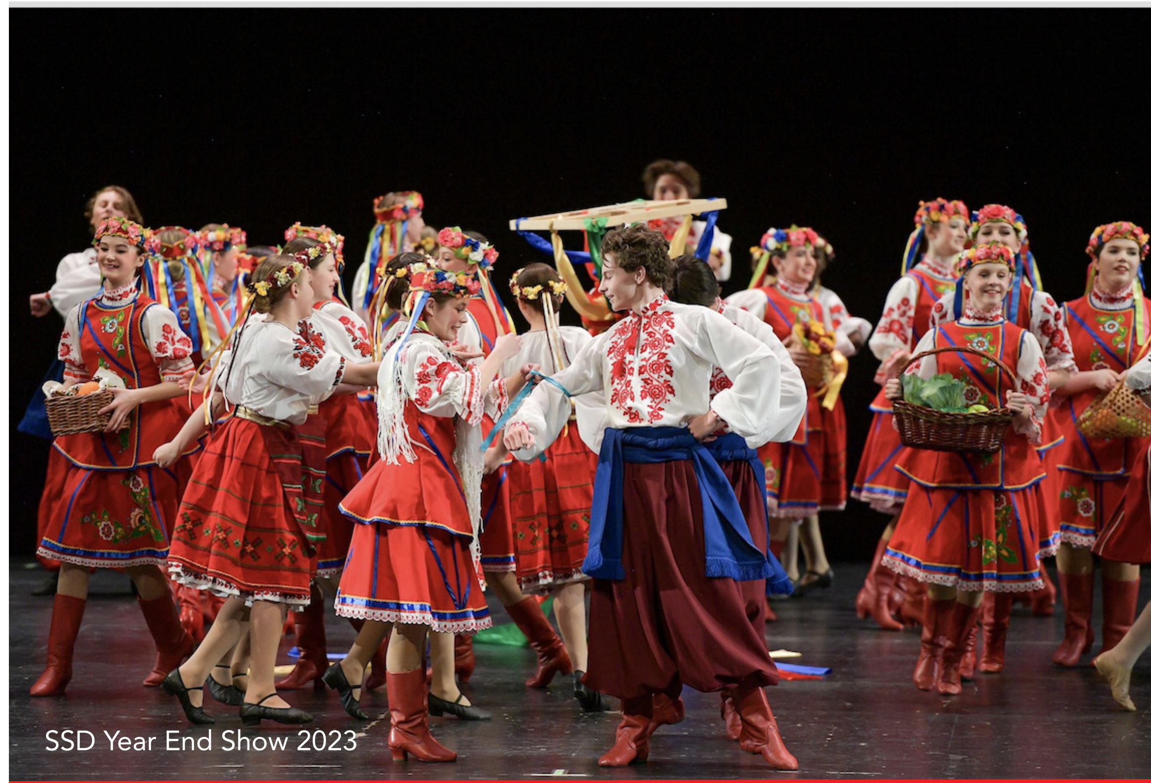
SSD Year End Show 2023

registrations across 42 different classes. With core-class instruction following Shumka's Syllabus for Ukrainian Dance to ensure a proper progression of technique, strength, and dance vocabulary, students continued to show promising growth and capability. The SSD prepared a total of 44 dances for participation at three separate dance festivals, as well as performances at St. John's Malanka, Edmonton General Continuing Care Centre, UFest, and two SSD concerts at the Jubilee Auditorium.