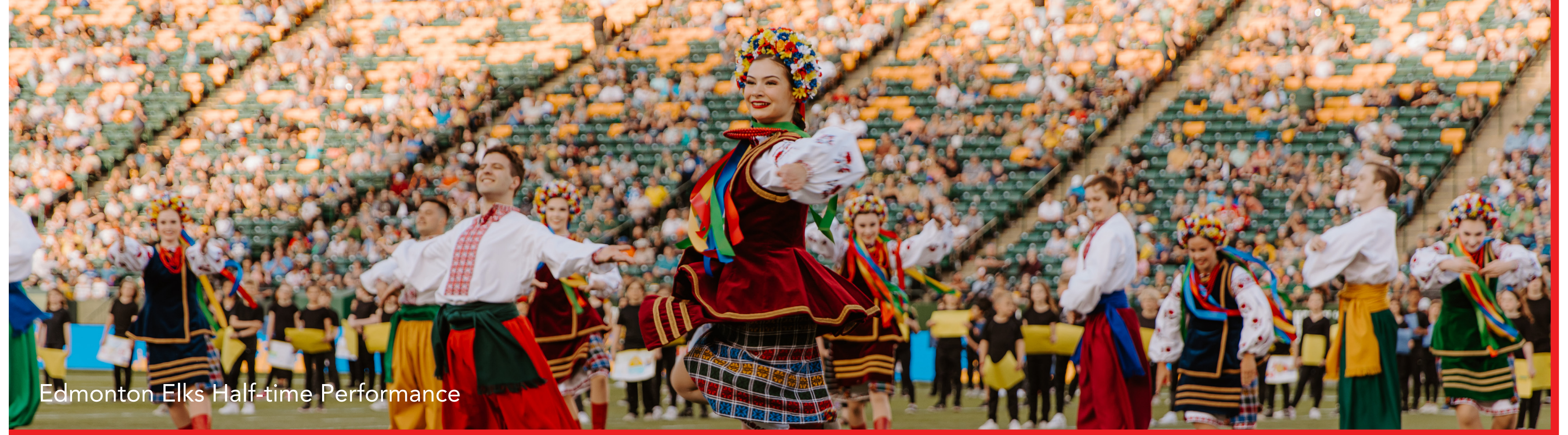
Edmonton Elks Half-time Performance