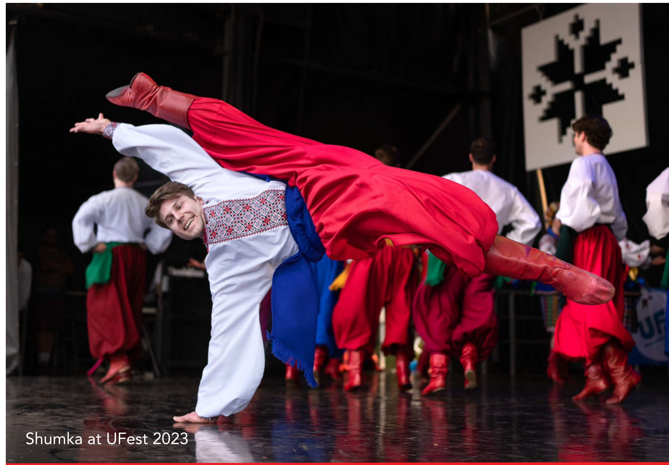
Shumka at UFest 2023