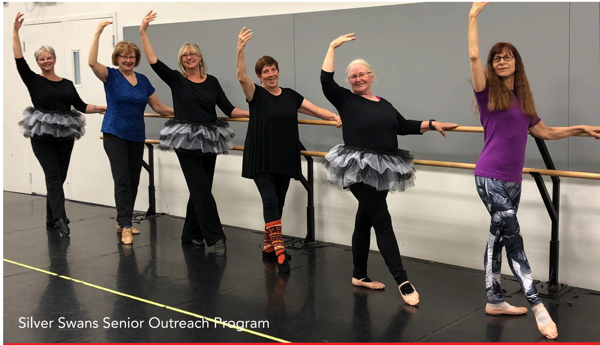
Silver Swans Senior Outreach Program