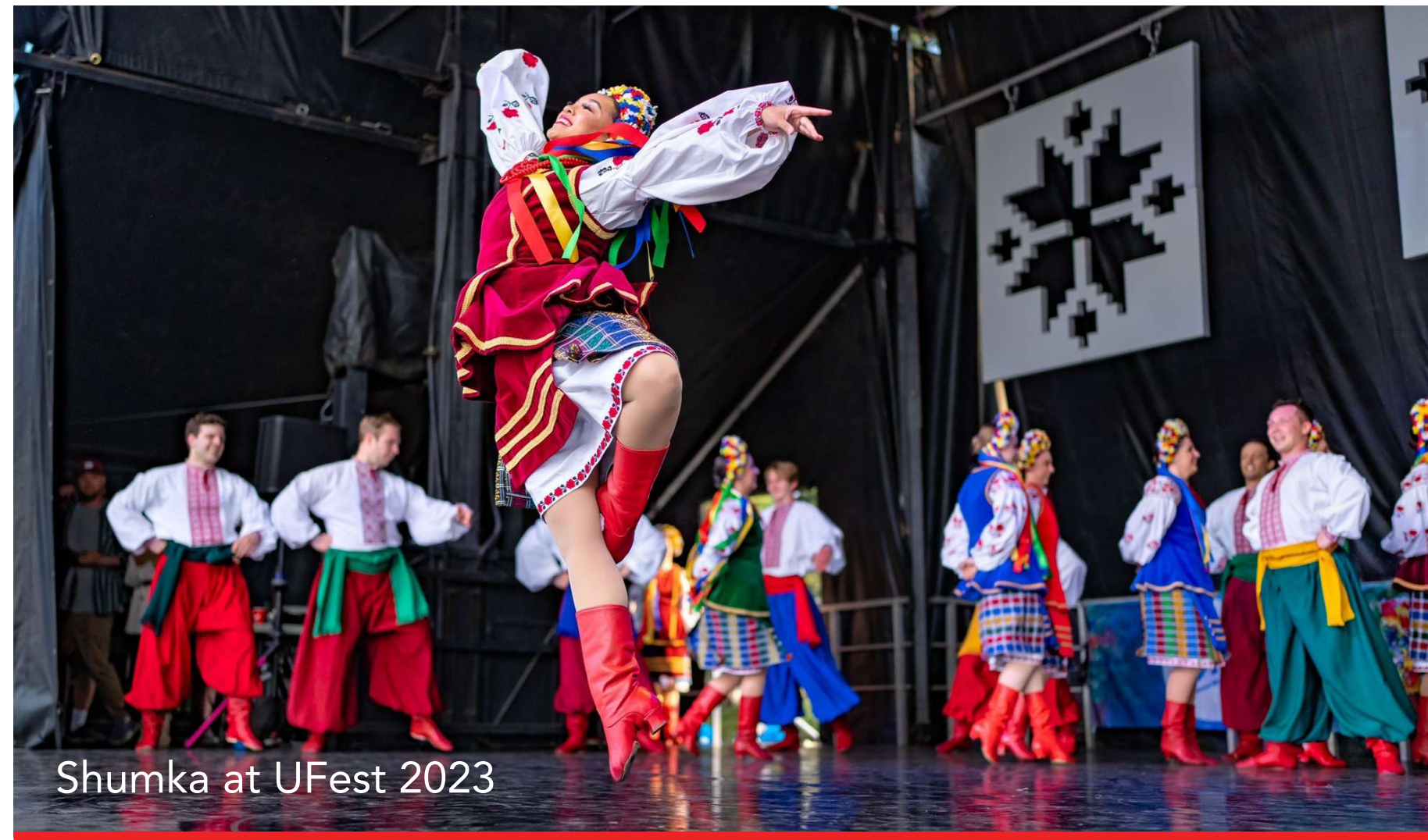
Shumka at UFest 2023