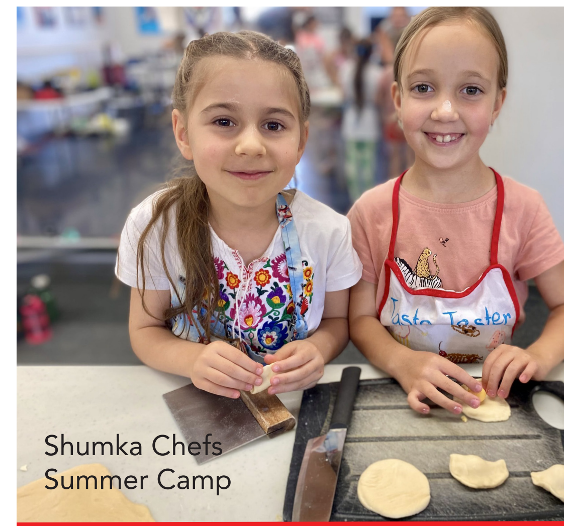
Shumka Chefs Summer Camp

Shumka Summer Dance Camps (SSDC) were able to resume normal operations in 2022 after two years of limited capacity due to public health restrictions. Once again offering SSDC's established variety of day-camps and overnight intensives, SSDC saw a dramatic 145% increase in registrations from the year before, nearing a full return to pre-pandemic numbers. The skillful mix of high-caliber dance instruction and exhilarating summer-fun activities enticed new and returning registrants of all ages from across Canada and abroad.