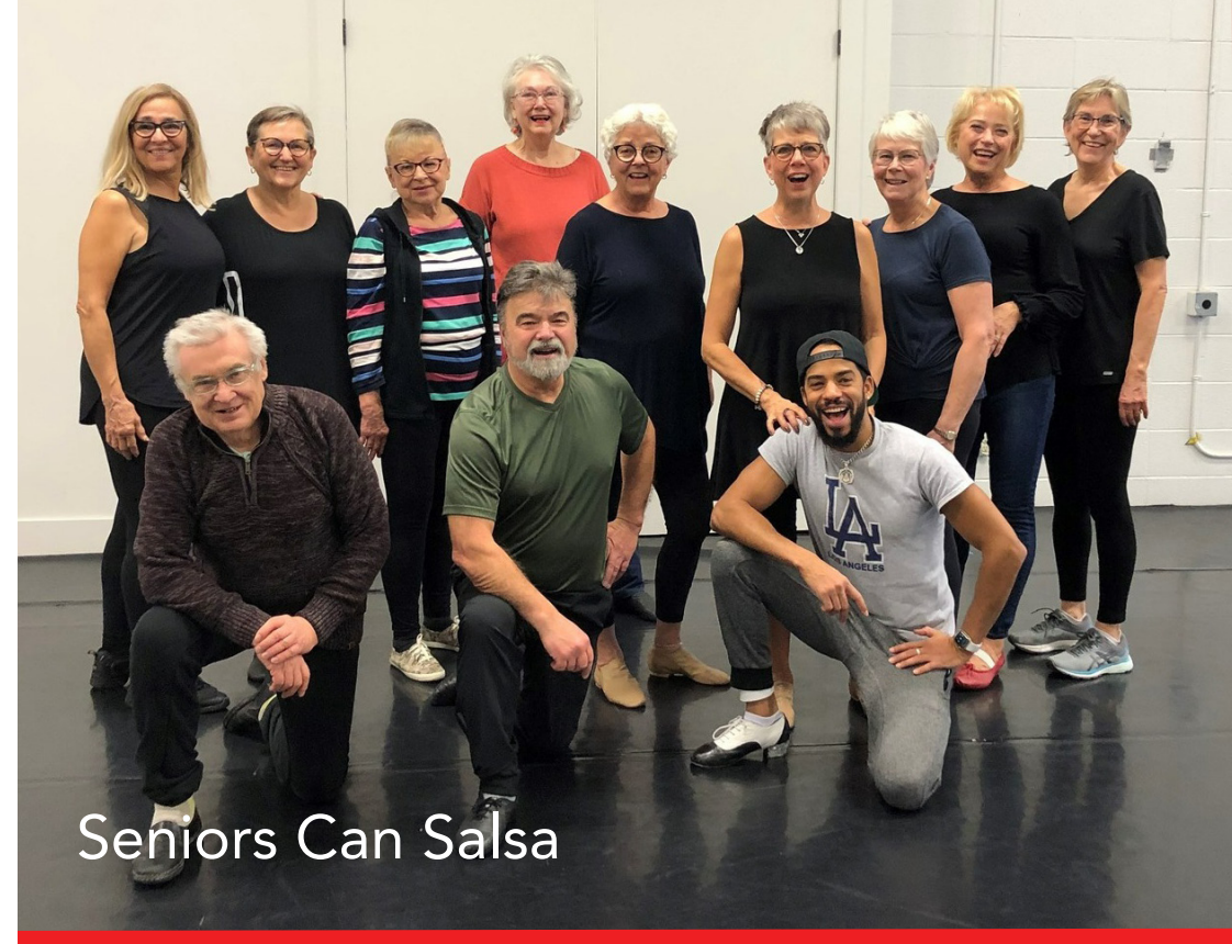
Seniors Can Salsa

The beating heart of Shumka's outreach initiatives, Seniors Can Shumka and Silver Swans, continued to grow and thrive this year. Besides performances at the Shumka School of Dance's Year End Show, dancers in the Seniors and Swans programs had the opportunity to participate in several different interactive workshops at senior care facilities in the Edmonton area. The 2022-23 season introduced an exciting new program: Seniors Can Salsa! In total, all three programs saw a combined 169 registrants – a 41% increase from the