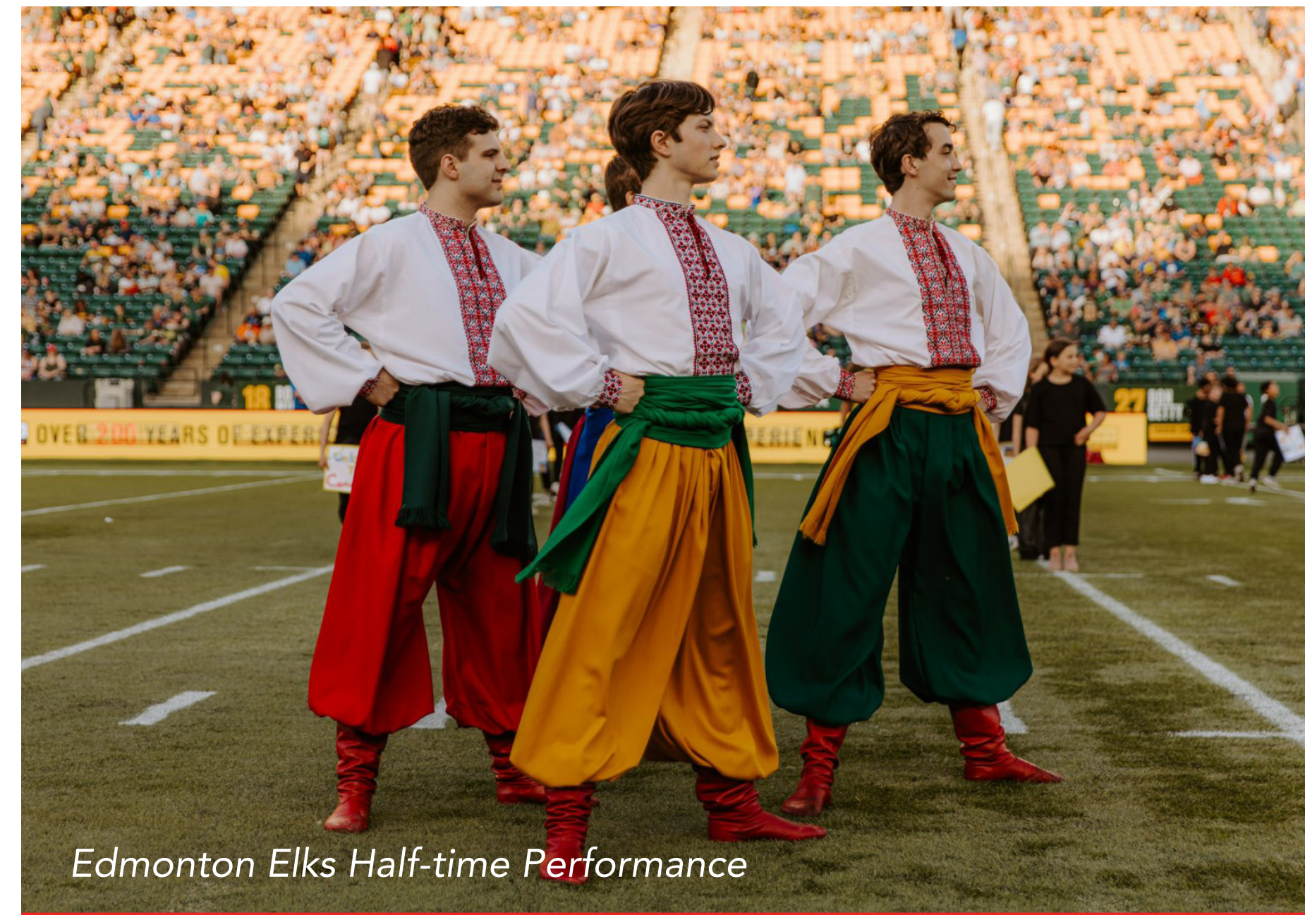
Edmonton Elks Half-time Performance