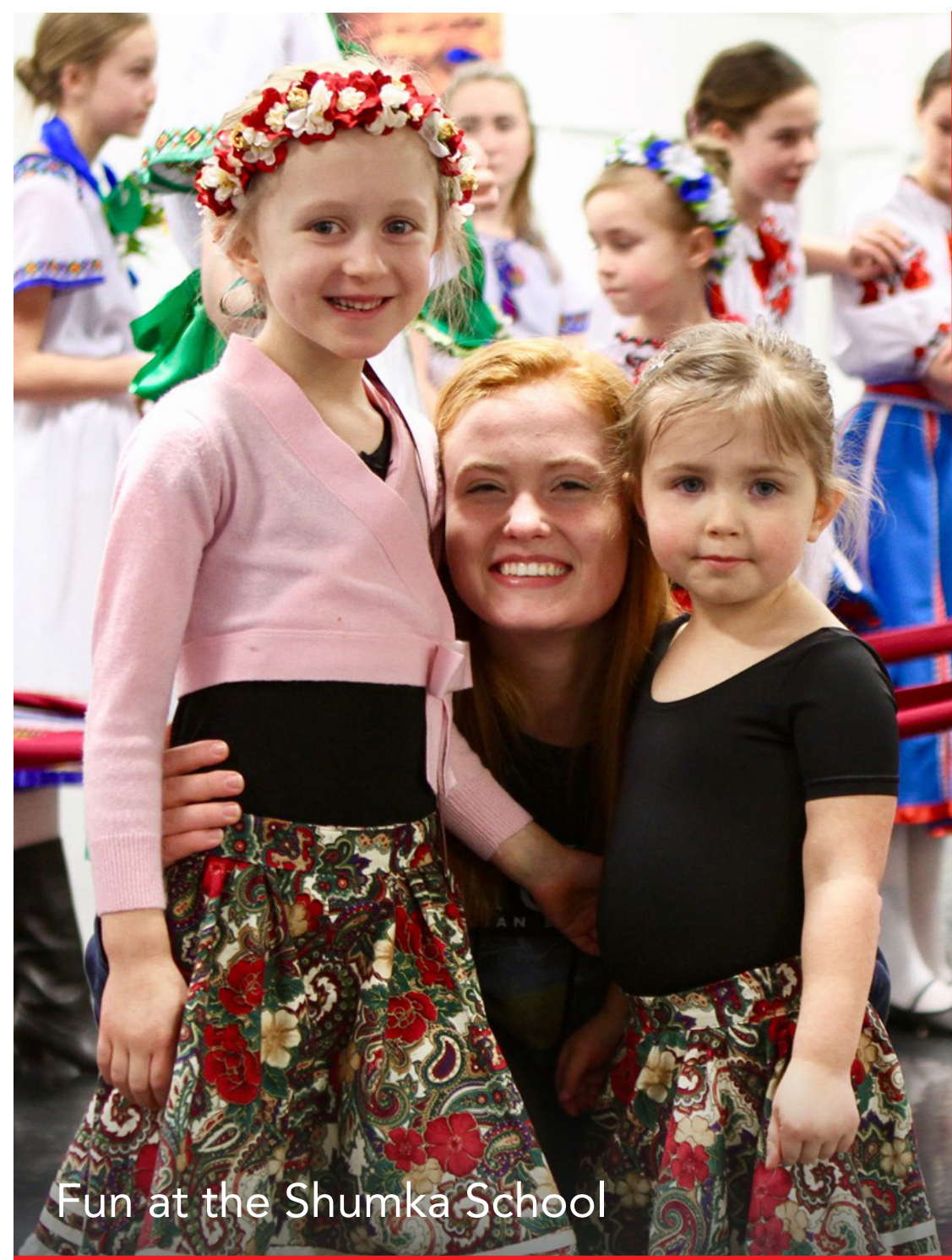
Fun at the Shumka School