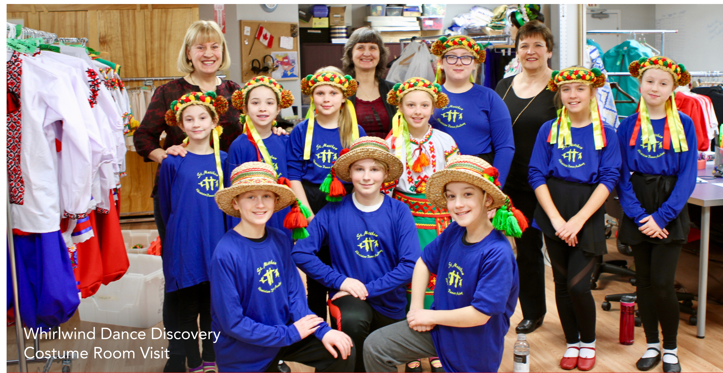
Whirlwind Dance Discovery Costume Room Visit