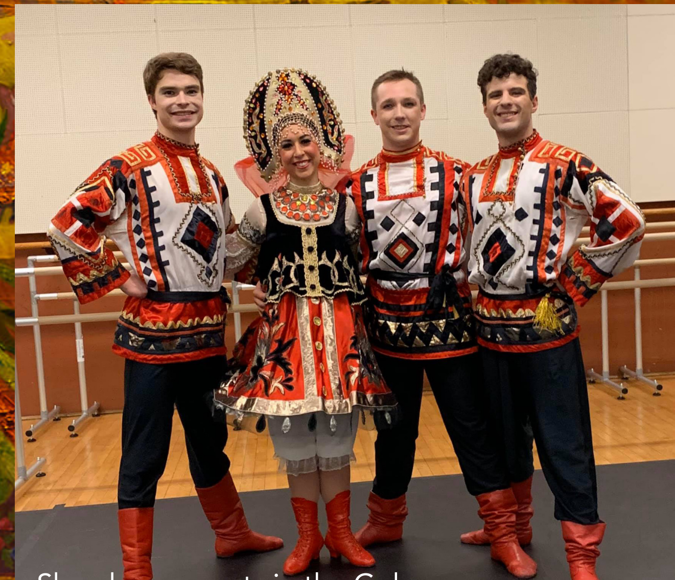
Shumka as guests in the Goh Ballet Nutcracker in Vancouver