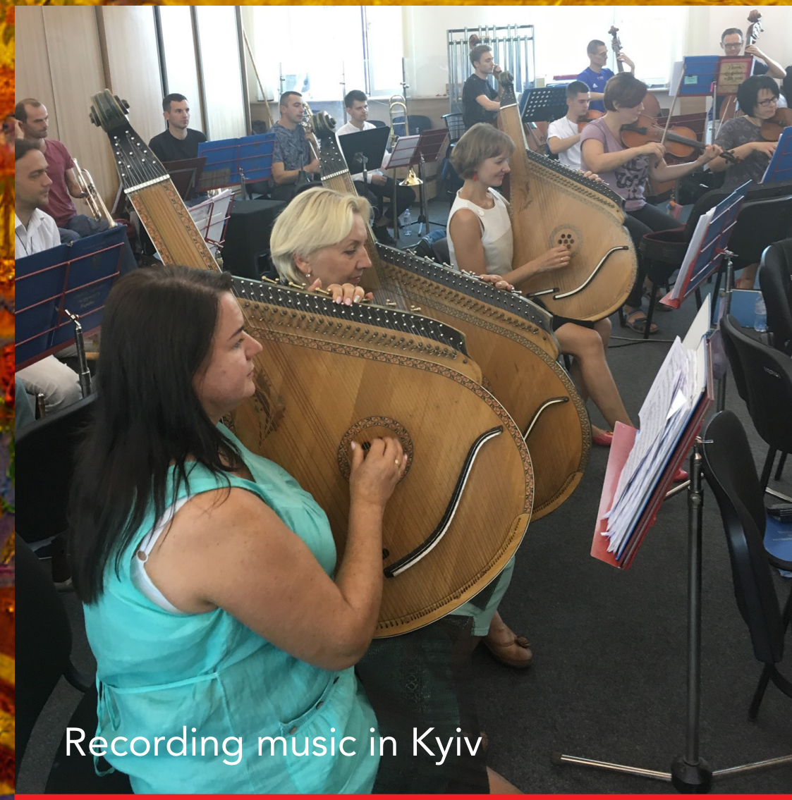
Recording music in Kyiv