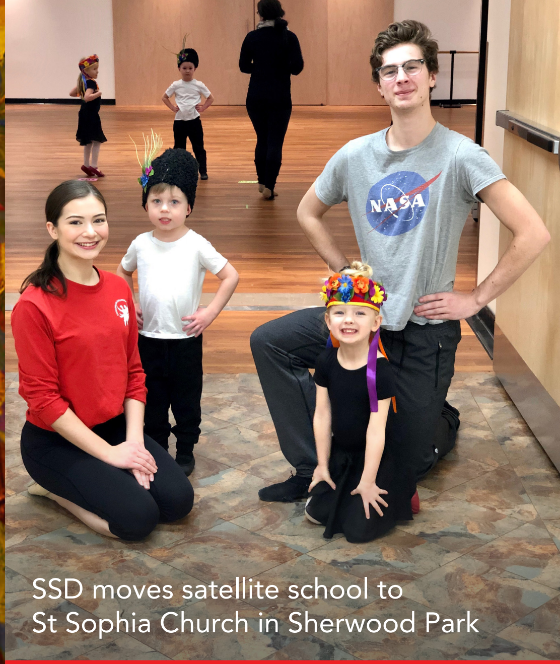
SSD moves satellite school to St Sophia Church in Sherwood Park