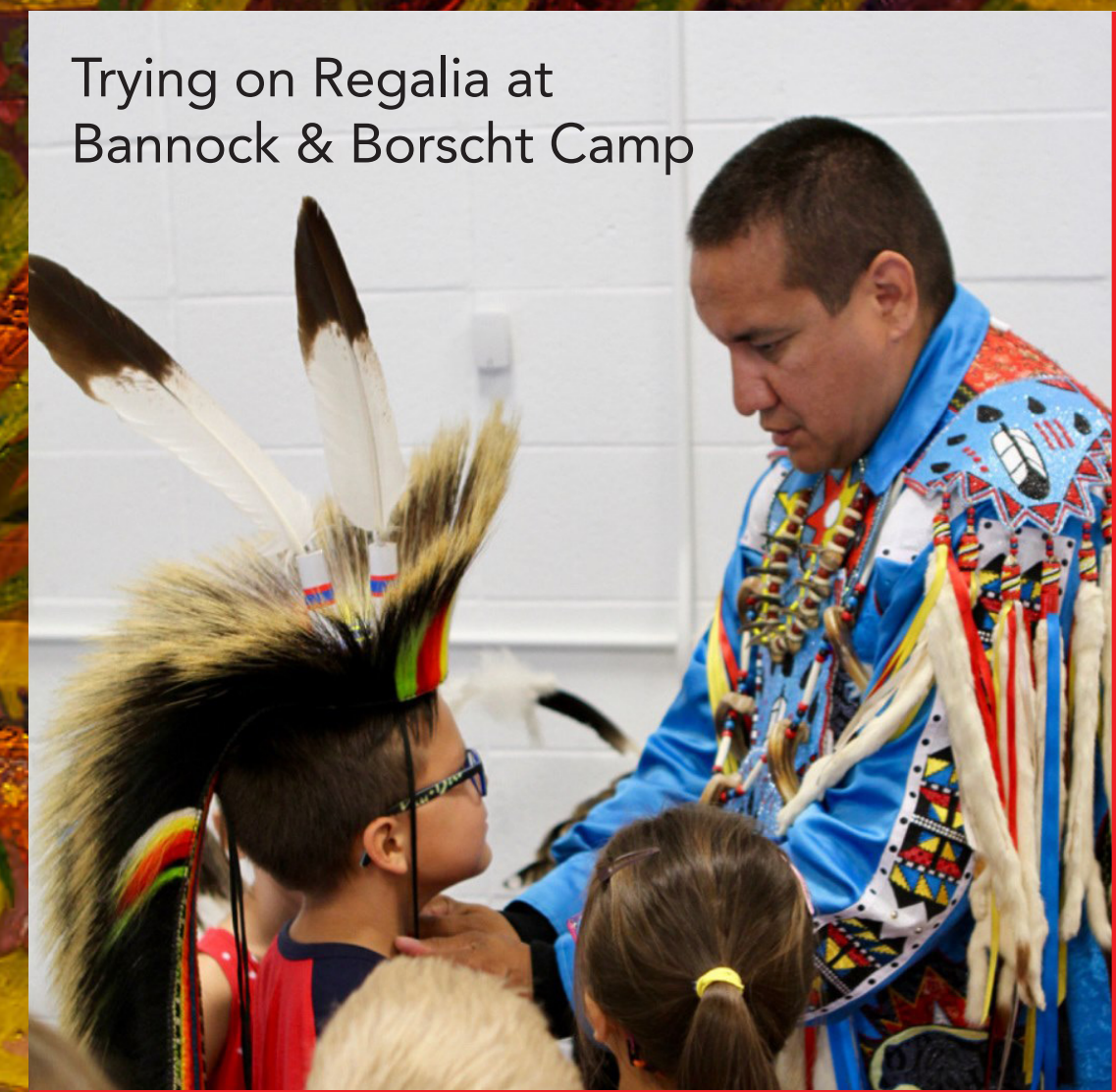
Trying on Regalia at Bannock & Borscht Camp